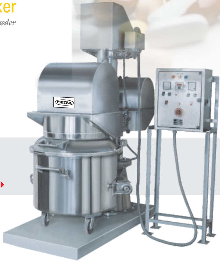
200 Ltrs. Planetary Mixer ▶