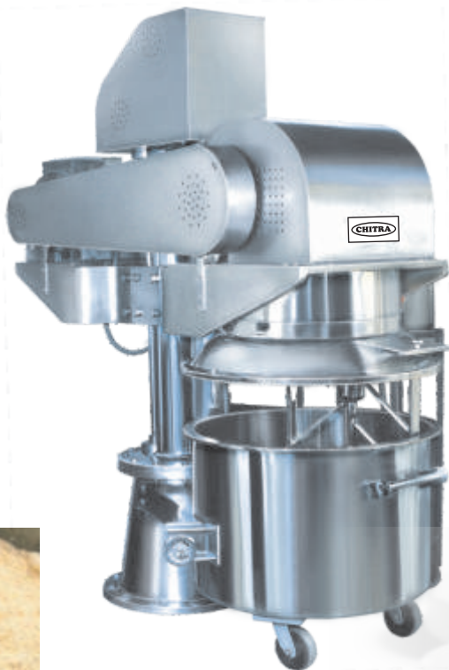
◀ 200 Ltrs. Planetary Mixer