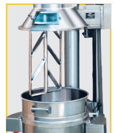
◀ Mixing Assemble